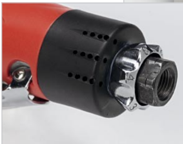
Individual speed control