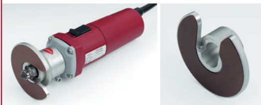
Profila E special